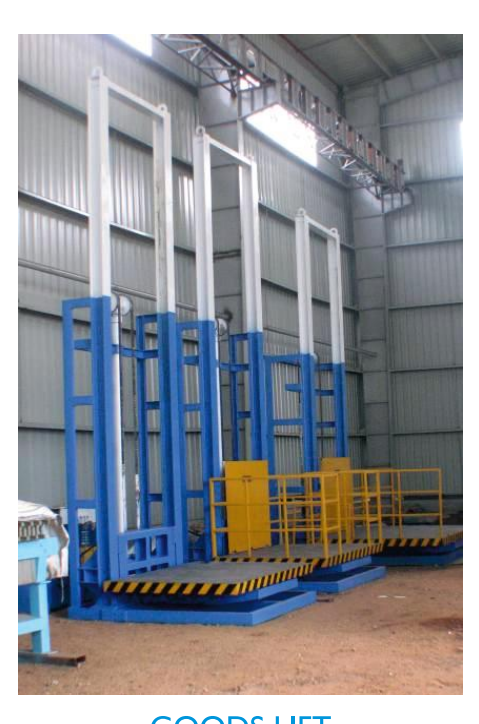
GOODS LIFT WITH HANDRAIL