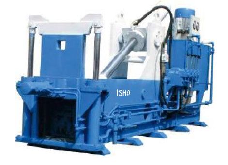
DOUBLE COMPRESSION FRONT EJECTION