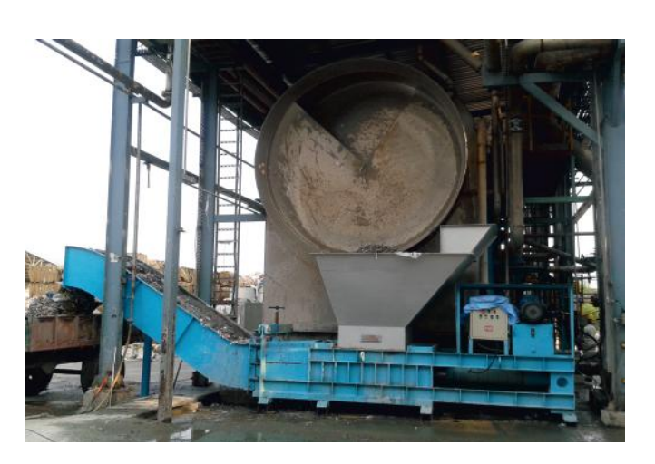
COMPACTOR FOR WASTE PULP