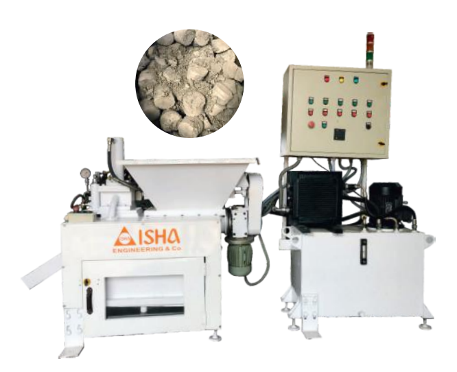
OIL SQUEEZING PRESS