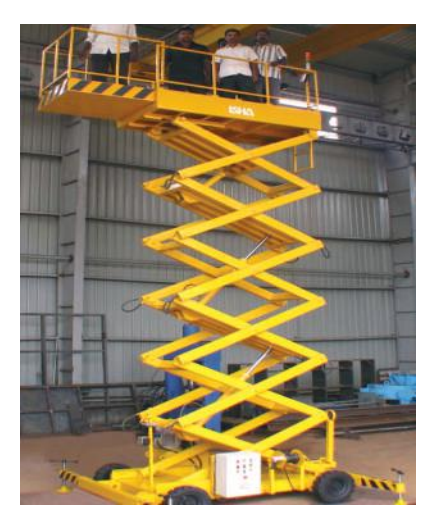
SCISSOR LIFT WITH TOWABLE